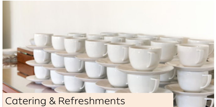
Catering & Refreshments

All services conducted within our Reflection Rooms also include a complimentary 'Celebration of Life' DVD presentation. Each presentation includes up to 30 photographs, accompanied by a single piece of music.