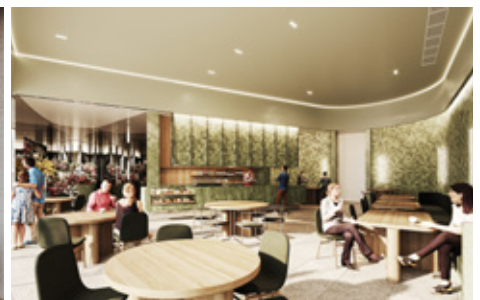
A New Era of Reflection

Work is nearing completion on our new $25 million Multi-Function Community Precinct at Enfield Memorial Park. With spaces for up to 500 people and expanded food and beverage options, the expected completion of this project will be early 2023.